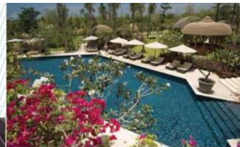
Cabana pool view