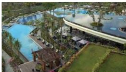
Cabana aerial view