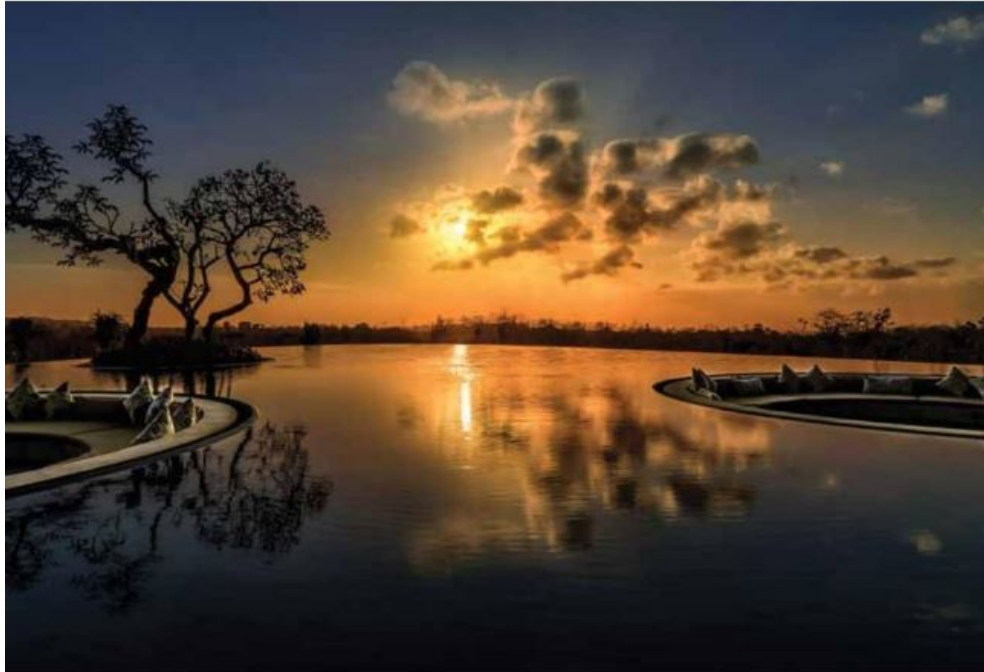
Sunset at lobby

landscape grading (land forming) helped to create the feeling of grandness of size and openness.