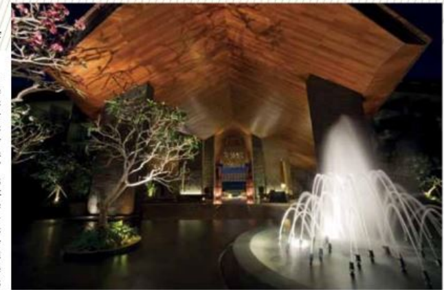
Lobby night time

"Since Rimba is set back from the coastline with no immediate relationship to the ocean, it was also key to have lots of water in the landscape design. Guests enter the lobby and immediately see a reflecting pond with a horizon view of the ocean," continues Selinger. "Starting from the lobby as the highest point, five terraced pools cascade into each other and even overhang each other. To make this possible, St Legere made the key decision to raise the lobby level by several metres, affording the view, more height for cascading levels of pools and also allowing back-of-house and services to be located underneath the lobby which saved the huge expense of any excavation into